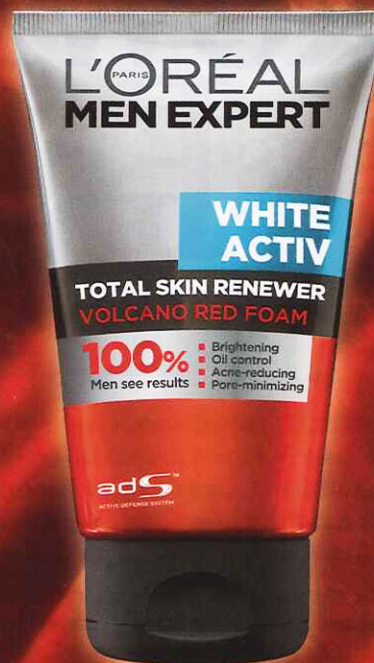
L'OREAL PARIS MEN EXPERT WHITE ACTIV VOLCANO RED FOAM > RM16.90