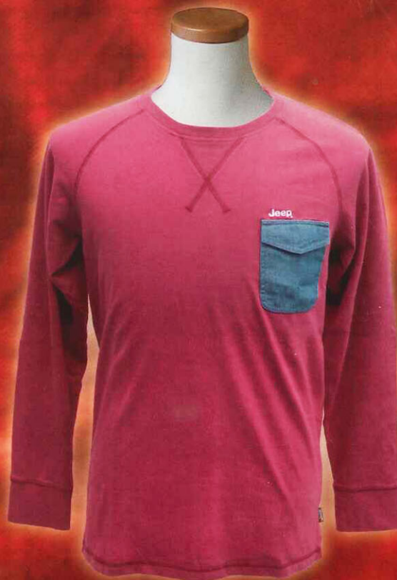
JEEP LONG SLEEVED > RM89.90