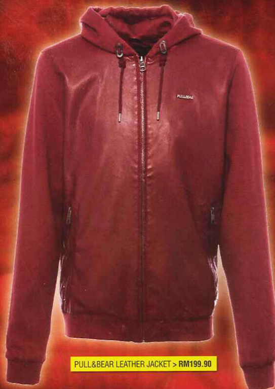
PULL&BEAR LEATHER JACKET > RM199.90