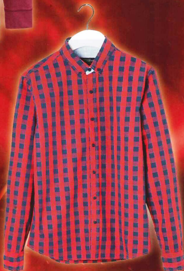
PULL&BEAR CHECK SHIRT > RM159.90