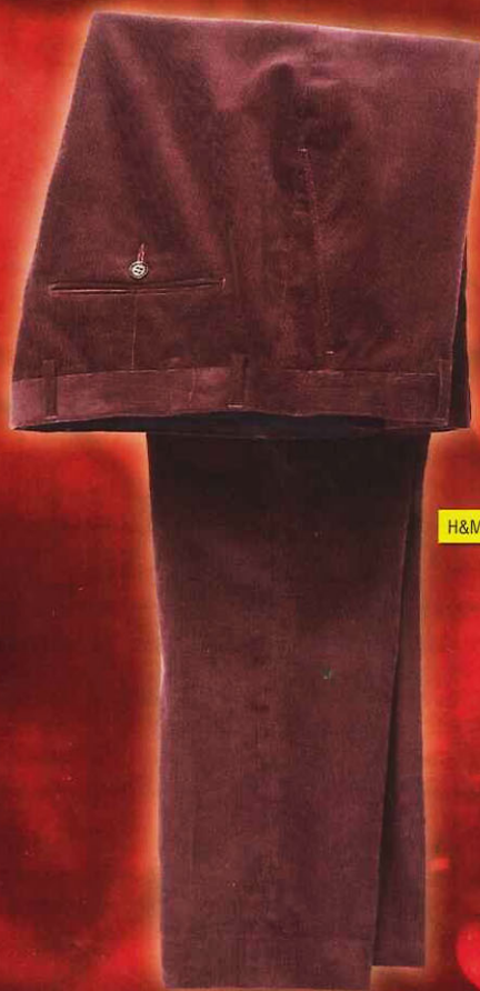
H&M TROUSERS > RM149.00