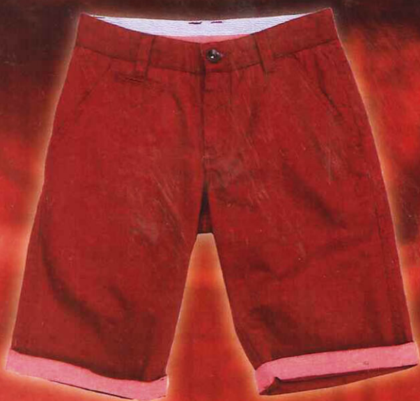
CHARGERS OUTFITTERS POLKA > RM99.90