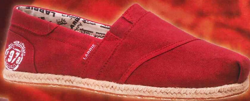
LARRIE LOAFER > RM100.00